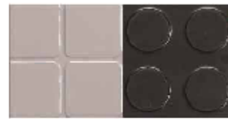
Treads are available with slightly raised discs or squares.