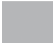
69 light gray