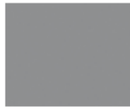
71 mid gray