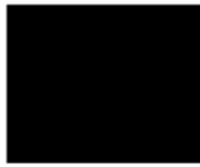
60 jet black