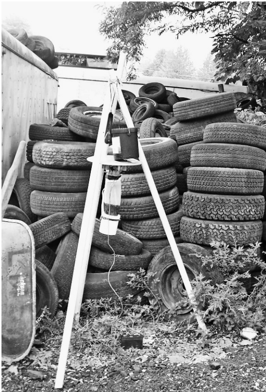
Fig. 2. Vector surveillance tripod support for use with CO 2 -baited traps. A CDC miniature light trap is shown with its dry ice CO 2 source.

by Aedes aegypti (L.) and Ae. albopictus (Skuse) (Braks et al. 2003, Delatte et al. 2008, Farajollahi and Nelder 2009) and West Nile virus vectors (Brown et al. 2008). The support also potentially eliminates random differences between samples inherent to previous methods reliant on vegetation; such variables include interference of nearby foliage to the trap's suction and CO 2 or other attractant plumes, precise height above the ground, and variations in the micro-environment (e.g., amount of shade and proximity to particular structures). Furthermore, the tripod design comfortably fits in a typical surveillance vehicle (e.g., a standard pickup truck), because it is intrinsically collapsible, portable, and lightweight at less than 5 lb (2 kg), yet it effortlessly accommodates a hanging weight of 5–10 lb (2–5 kg).