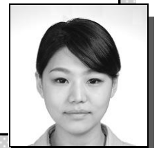
Photo fees can be included with the payment to the Mercer County Clerk

Children & Seniors (62 and older): $10 Adults: $15